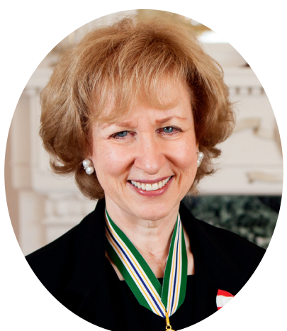
courtesy of the office of the Rt. Hon. Kim Campbell.

The constitution states that elections must be held every five years, but traditionally they are held approximately every four.